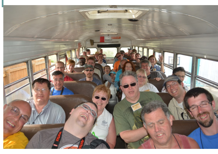
ACE Members heading backstage for our after dinner tour

If the rides weren't special enough, we were treated to a dessert buffet of hand-scooped banana splits, cheesecakes, chocolate cakes, and cookies along with a toppings bar. After consuming large amounts of sugar, we were