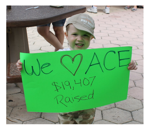
A recent Wish child expresses thanks to the ACE for Kids donors