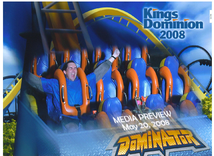
Stephen Peeples on Media Day!

After the impressive lunch spread (carved turkey and roast beef among other items and a chocolate fountain for dessert), we headed back to the coaster for the afternoon. The media folks took a few rides then headed off for lunch and to file their stories. The ACE members filled back in for yet more rides. I waited for a front row spot for ride number 29, then managed to get back on the front row with a fellow ACer Todd Neese for ride number 50 for both of us. We called it a day at that point. I claimed my complimentary ride photo, and headed home to Lynchburg.