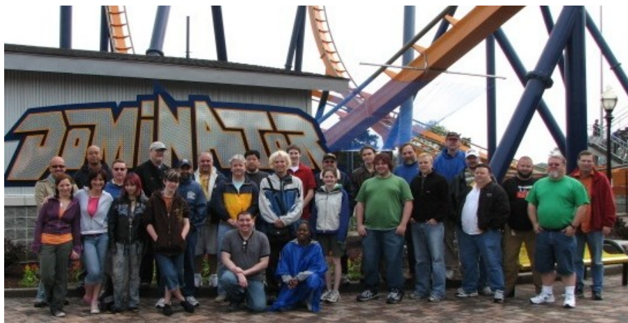
ACE Members at the Dominator media day