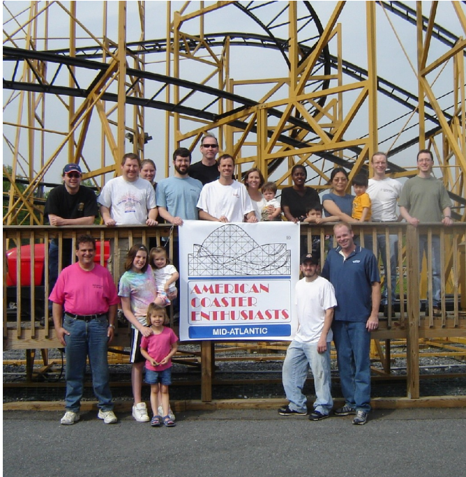
Attendees at Springfest 2008!